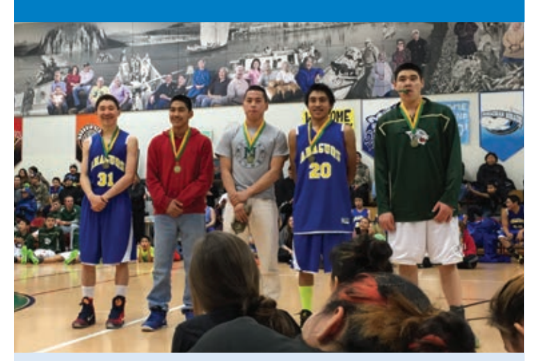
Boy's All-Tournament team at the SIVU Tournament in Noatak.